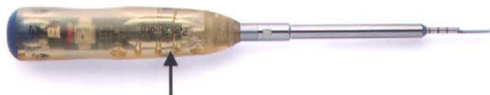
Figure 3: PediGuard with the LED Illuminated